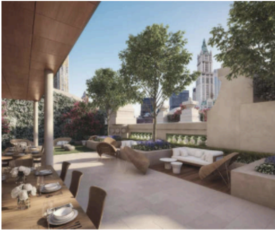
Landscaped terrace

Building amenities are said to be outstanding, and will emphasize health and wellness. There will be spaces for fitness, play, entertainment, and relaxation. The swimming pool will have vaulted ceilings, traced from the oval arches and glass ceilings of the building's historic Banker's Hall. Other amenities will include a sleek modern hammam, a cardio exercise room with a separate yoga studio, a virtual golf room, a game room, and multiple entertainment and business lounges —nestled in the building's foundations to form a 14,000-square-foot urban resort. The rooftop has an indoor-outdoor garden, convertible dining nooks, views of City Hall Park and the Woolworth Building .