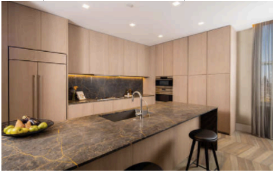
Open-concept kitchen; Williams New York

As we can see from the published renderings, the impeccably designed interiors use warm and earthy tones to complement the old glamour of the landmarked structure; accents of bronze, metal and mirror can be seen throughout the opulent residences which include custom hardwood flooring in a herringbone pattern, Roman-reminiscent bathrooms carved out of honed Ariel White marble, custom-designed double vanities in the bathrooms. The large-dimension windows and doors will illuminate the homes from within, and for extra warmth, radiant floor heating will be installed throughout.