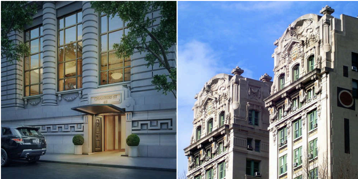
Rendering of entryway and crown detail of 49 Chambers

In a space-starved city of skyrocketing land and housing prices, converting existing commercial buildings into residential units is a growing trend. Besides the benefit of adding to the city's housing stock, historically significant structures get the chance to reclaim their former glory. A perfect example of this is the conversion of the Emigrant Industrial Savings Bank building at the junction of Tribeca , the Civic Center, and the Financial District .