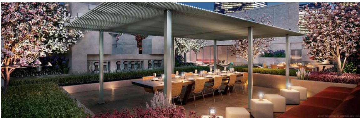
Outdoor dining; Williams New York

According to Marketing Directors Inc , who are handling sales on 49 Chambers Street , the conversion will house 99 units which will range from one-, two-, three-, and larger