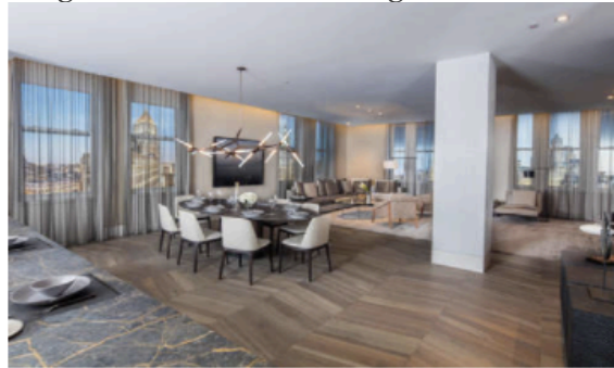
Dining room and expansive living area; Williams New York