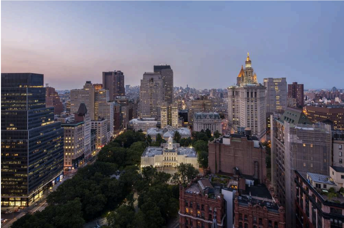
49 Chambers Street on the city skyline

The Emigrant Industrial Savings Bank was designed by Raymond F. Almirall and finished construction in 1912 when it became one of the country's largest bank buildings at 17 stories. Almirall's decision to use an H-shaped layout, for what was then considered a skyscraper, was unprecedented and had the added benefit of circulating air and natural light into its massive wings. Now the building's original high ceilings and its H-shaped floor plan continue 'breathing new life,' so-to-speak, into the former bank.