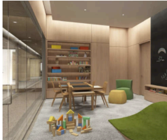
Children's playroom; Williams New York