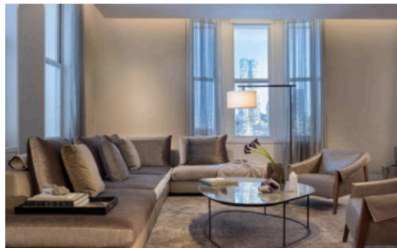
Living room; Williams New York