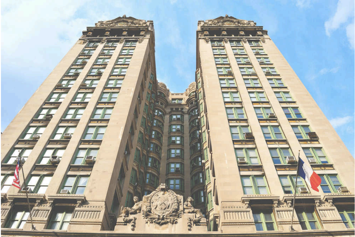
The Emigrant in all its glory

The 14-story tower will forgo the offices it previously held, only to reserve the ground level for retail, and the newly-added condo interiors, designed by Gabellini Sheppard . Residences will have modern fishings which, while minimalistic, showcase the designer's aesthetic of functional luxury and complement the building's impeccable craftsmanship. The lobby, like the exterior, will maintain the building's moniker Beaux-Arts style while the interiors will receive a sophisticated yet contemporary upgrade.