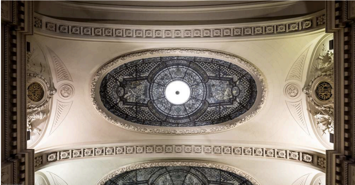
The Beaux-Arts ceiling

As we can see from the published renderings, the impeccably designed interiors use warm and earthy tones to complement the old glamour of the landmarked structure; accents of bronze, metal and mirror can be seen throughout the opulent residences which include custom hardwood flooring in a herringbone pattern, Roman-reminiscent bathrooms carved out of honed Ariel White marble, custom-designed double vanities in the bathrooms. The large-dimension windows and doors will illuminate the homes from within, and for extra warmth, radiant floor heating will be installed throughout.